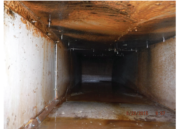
Square kitchen exhaust duct that has been screwed together in lieu of welding, opening the door for leaks through seams and screw holes.

While most jurisdictions accept one or more of the test methods shown in Table 1, light and smoke tests are by far the most frequently applied. But how effective can a test that is meant to prove liquid tightness be when no actual liquid is used in the test?