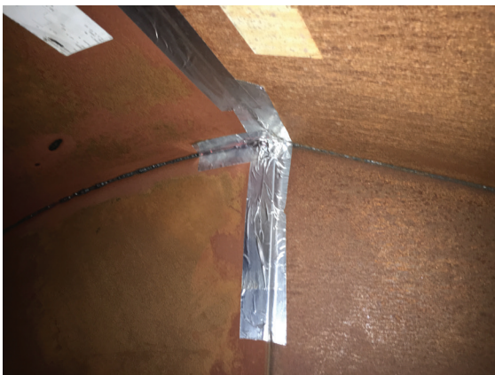
Grease duct seams inappropriately covered with duct tape (typically used for residential clothes dryer exhaust duct), presumably applied to pass a leak test.

Unfortunately, there are no safeguards or regulations in place to keep any of this from occurring. And when problems do occur, the inevitable finger pointing ensues.